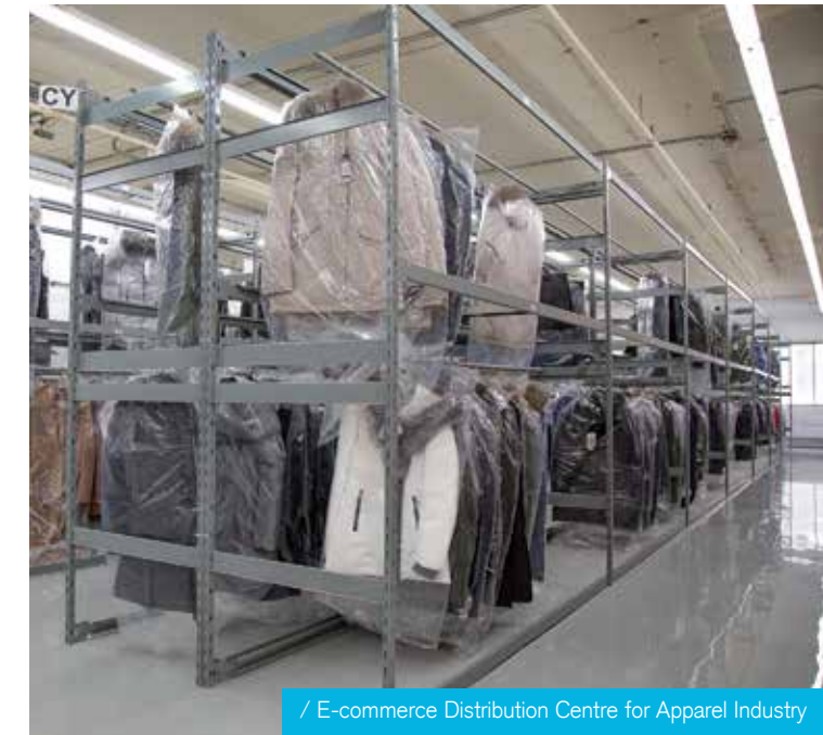
/ E-commerce Distribution Centre for Apparel Industry