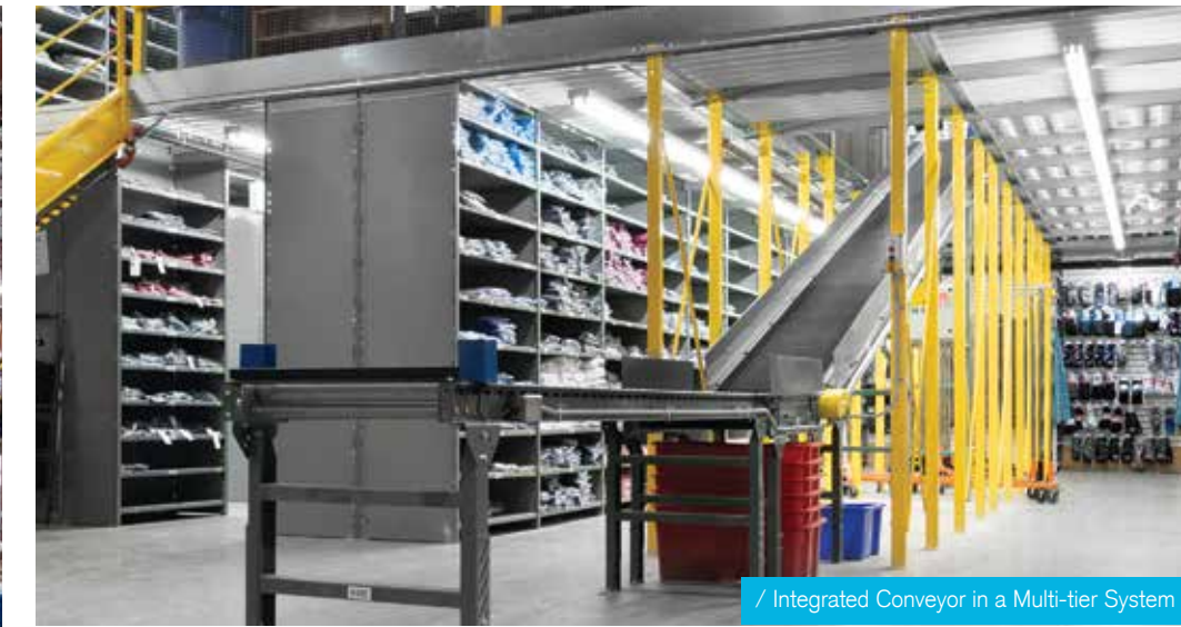
/ Integrated Conveyor in a Multi-tier System