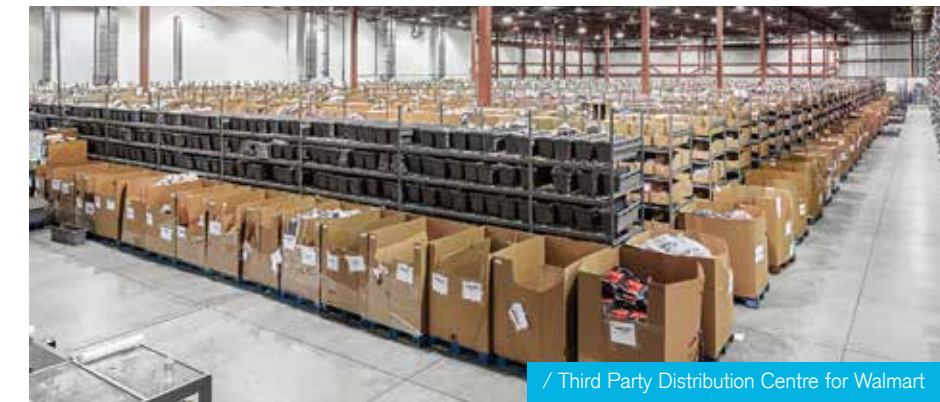
/ Third Party Distribution Centre for Walmart