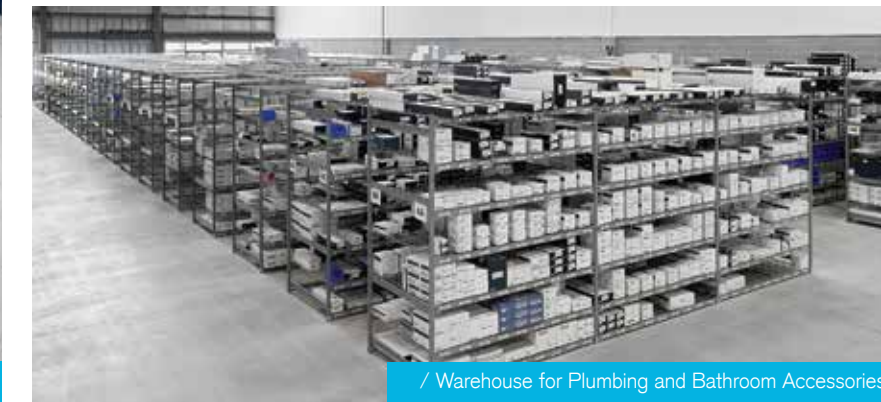
/ Warehouse for Plumbing and Bathroom Accessories