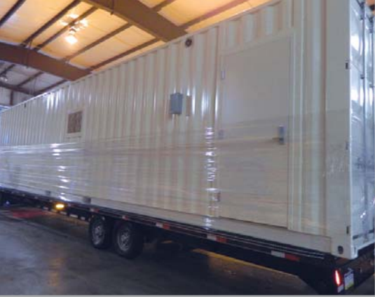
Completed conex modular building ready to ship