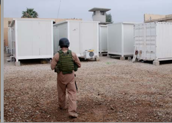
Military units for a variety of rapidly deployable, customizable systems