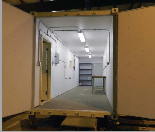
Interior of completed building